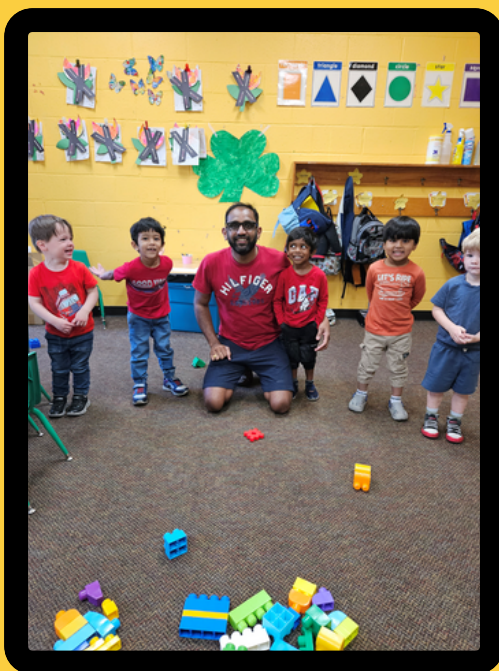
RUDRA'S DAD CAME TO VISIT. :)